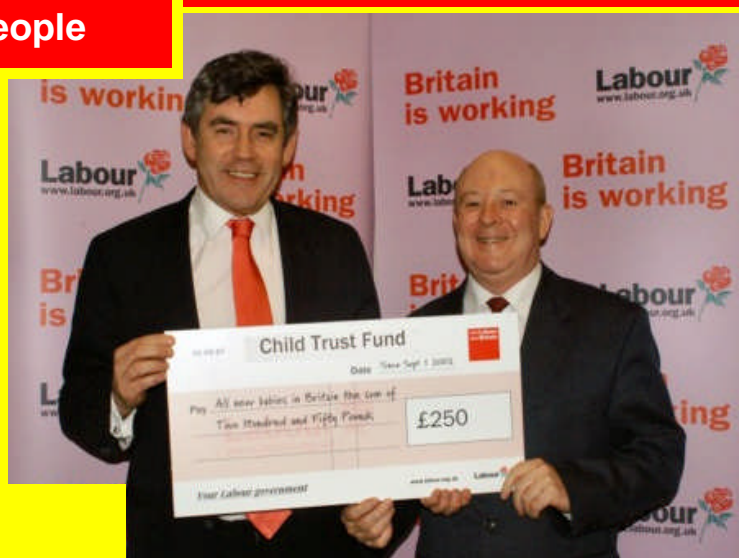
David and Gordon Brown at the Child Trust Fund launch