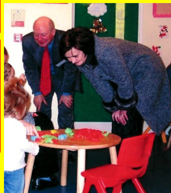
David and Cherie Blair opening a Gateshead nursery