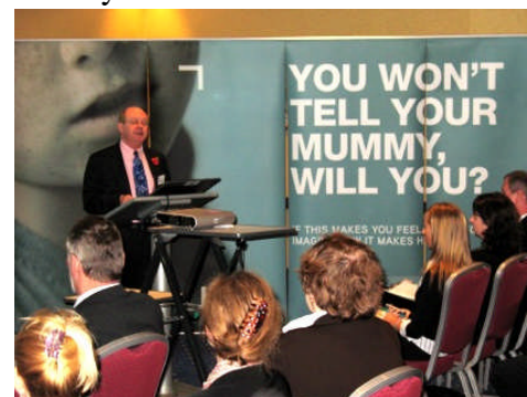
Internet Watch Foundation Conference, Newcastle

posed by the internet. It can be a wonderful gateway to entertainment and knowledge, but the internet also holds the potential for harm to the unwary and naïve.