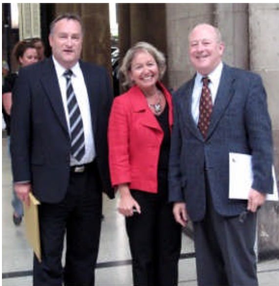
Above, with Roads Minister Rosie Winterton and Nick Brown, Minister for the North East

The fruit of a highly productive relationship between trades unions and Gateshead Council as employer, the Park Road centre is an excellent newly equipped training centre offering learning opportunities to adult workers. Much more than just 'up-skilling', the centre also ensures that the experience and the knowledge of skilled workers is passed on to newer employees.