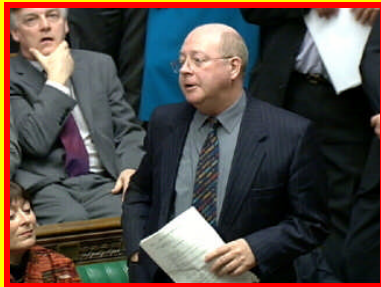
Speaking up in the House of Commons