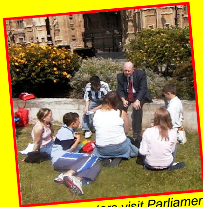
Local youngsters visit Parliament