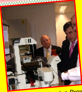
With Chancellor Gordon Brown at the Centre for Life in Newcastle