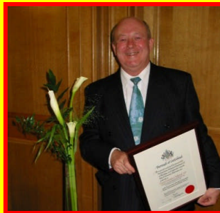
Made Hon. Alderman for services to Gateshead Council