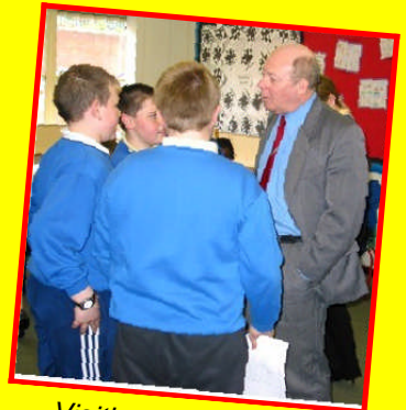
Visiting local primary school