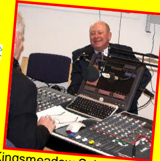
Kingsmeadow School Radio In Dunston