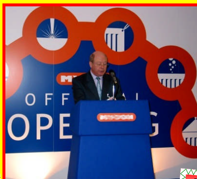
Opening new factory production line in Gateshead