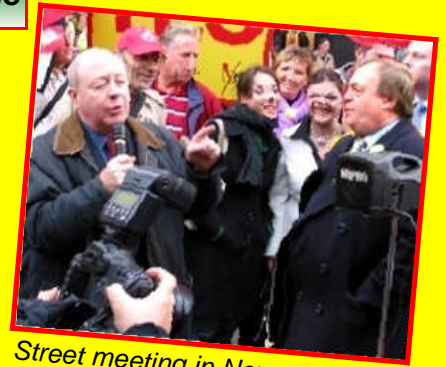
Street meeting in Newcastle with John Prescott