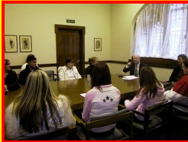
With Gateshead College students at Commons