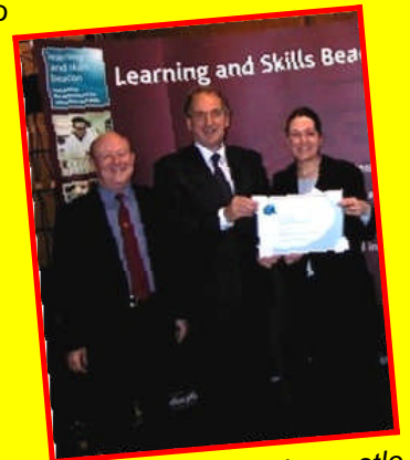
Minister presents Newcastle College with Beacon Award