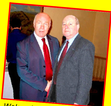
Welcoming Health Secretary John Reid to Newcastle