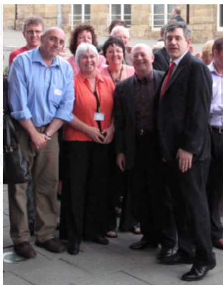
(Gateshead colleagues with Gordon Brown at the Newcastle Hustings)