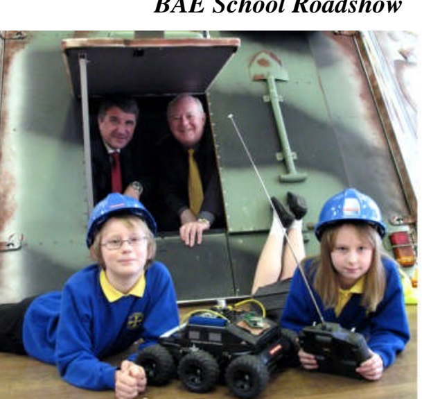
BAE School Roadshow

BAE Systems puts on well presented plays and discussion groups schools encourage youngsters think about engineering as a future career. (pictured in an engineering stageprop with BAE Scotswood