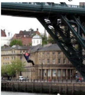
Fund Raising Abseil off the Tyne Bridge

There have been big changes too in our economic infrastructure. The region, in 1986, was still reeling from the impact of Thatcher's economic policies, the miner's strike had just ended and shipbuilding was in decline, forcing our economy to diversify. Despite the headlines, the UK is still the 6th largest exporter and manufacturing survives albeit in a different format.